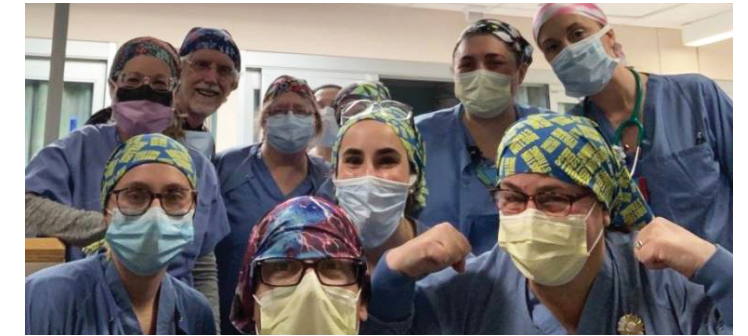
Members of the ICU team

Vaccination remains the key to reducing the spread of COVID-19 and the number of Americans we lose to this disease. Local, state and federal statistics as well as numerous studies continue to prove the efficacy of vaccination in reducing risk of developing severe COVID-19, hospitalization and death. As a leader in the delivery of healthcare Sturdy was and remains active in offering and administering the vaccine to its employees and the public in general. Sturdy Memorial Associates held over 30 public clinics administering 9,416 shots to 4,952 individuals.