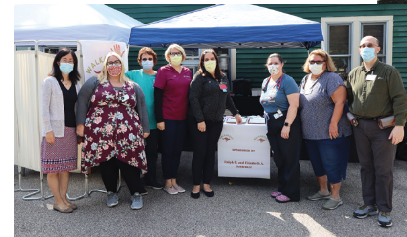
Walkabout COVID and Flu Vaccine Clinic

Sturdy is the local leader in Covid-19 testing, vaccine administration and advocacy. Our commitment to fighting COVID-19 will not wane until the pandemic is declared over!