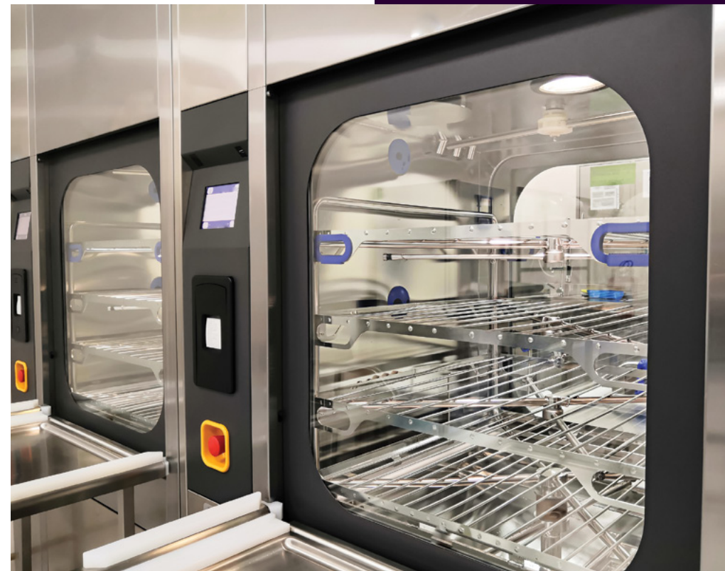
Central Sterilization Room (CSR)

The overall goal of increased efficiency around the sterilization of the equipment used in the operating rooms, endoscopy suites and maternity C-section operating rooms will be realized with the consolidation and streamlining of our patient safety sterilization process.