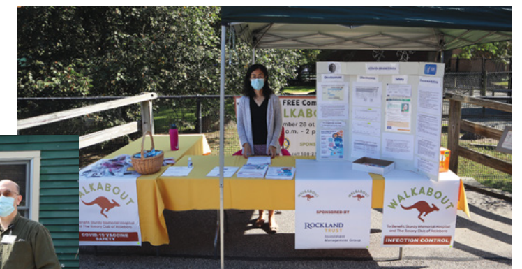
Walkabout COVID-19 Information Booth